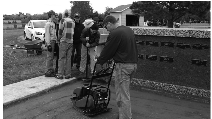
Saint Henry's cemetery received improvements last fall by Troop 270 boy scouts and their family members.

Once people and businesses learned the project was for Saint Henry's, much of the project materials and consulting expertise were discounted or donated. A family friend offered advice on landscaping methods. Schluender Construction donated materials and provided free