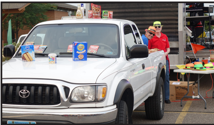
The local food shelf benefitted from donations made by festival participants.