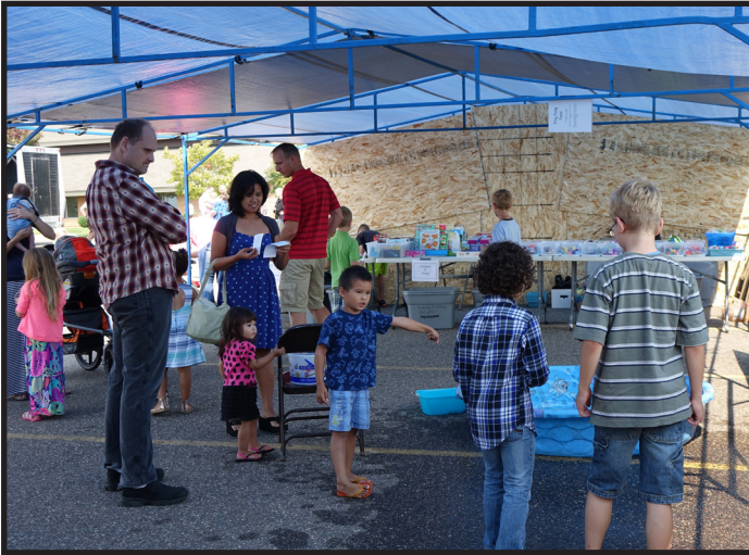
Kids' games remain popular at the Fall Festival.