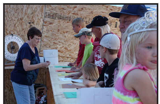
So many cakes, so many winners.