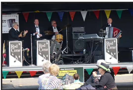
Music all weekend!