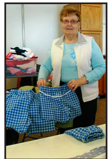
A sample of the many items created by the Sewing Group

Mission Group. A prayer scarf was sent in to the Boston Marathon in March 2014.