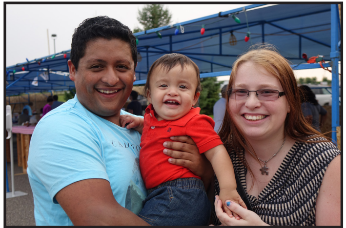
Family, fun, fellowship - and smiles!