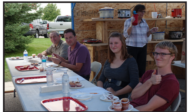
Chili contest judges.