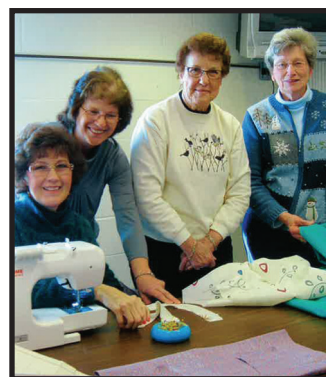
Four of the 15 active Sewing Club members with one of their trusty sewing machines!