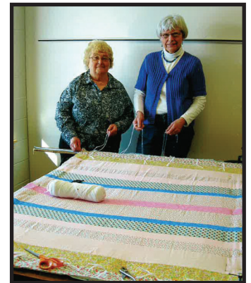
One of the many beautiful donated quilts.

Duluth Diocese for the Mariners who come into the Duluth Harbor, generally in need of winter caps, scarves, and ear warmers. They have sent clothing to orphanages in Medjagorie and Mexico. They pack boxes of these items to send to the Appalachian Christmas Mission project. They have sent baby quilts and blankets to Sharing and Caring Hands in Minneapolis. The VA Hospital has received 10 Twin Quilts from this group. Boxes of have been shipped to a Guatemala Mission including underpants, dresses, shirts, short, blouses, baby blankets, dolls, and more. St. Mary's Mission in Red Lake has received gloves, scarves, and caps in the past. The Wellstead of Rogers received 8 lap robes knit and sewed by our