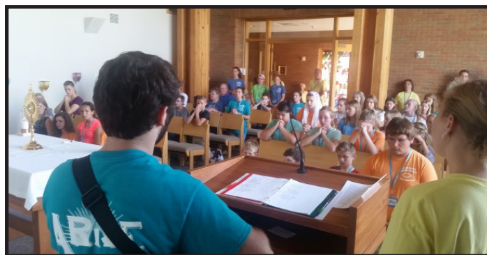
The Scrip program funds Family Faith Nights, as well as a variety of other youth activity expenses at Saint Henry's.