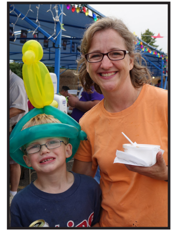
Family, food, and smiles!