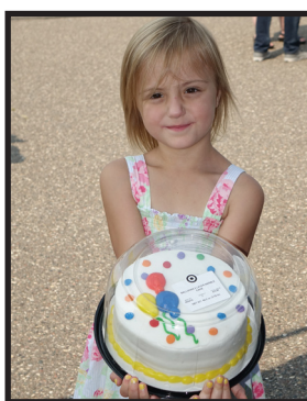
Cake walk winner!