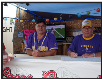
Beer and Vikings on tap!