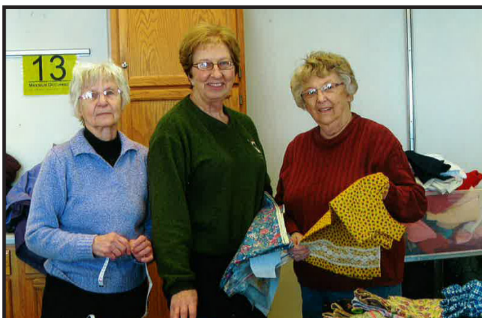
The Sewing Group makes beautiful hand-sewn items.