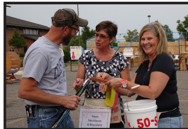
On the grounds drawings.