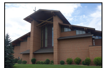
Catholic Church of Saint Henry, established 1997.